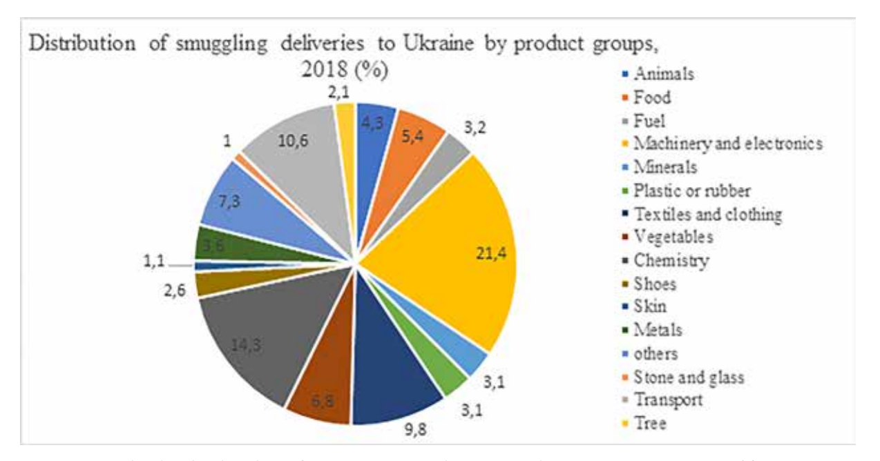
Fig. 1. Distribution of smuggled supplies to Ukraine by product groups, %

However, very notable episodes of cigarette smuggling were recorded last year.