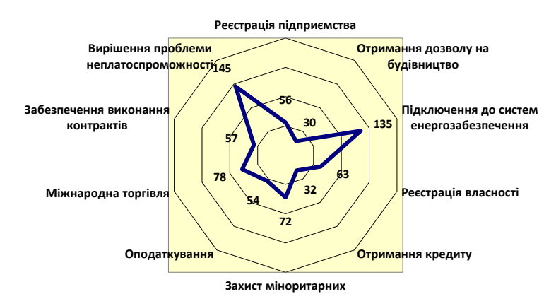
Fig. 1. Positions of Ukraine on core components of Doing Business rating 2019

Solution to the insolvency problem – вирішення проблеми неплатоспроможності